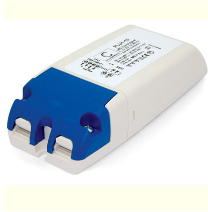
PLU/350 Power supply

This decking light is designed to be used exclusively with the PLU/350 power supply unit (cost £23.90 each +vat), each power supply unit will run up to 9 lights. The PLU/350 power supply as it is should be mounted indoors or can be fitted outside using the waterproof enclosure.