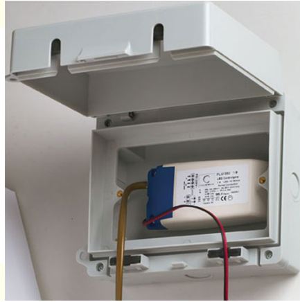
PLU/350 waterproof enclosure

Another option which makes wiring in the elements safer and much easier is using the JB2 junction box this is a fully waterproof enclosure that has 1 in point and up to lighting outlets depending on whether other JB2 boxes are to be connected.