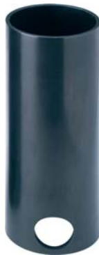
Concrete installation tube

This ground light can be mounted into wooden decking or into concrete, if mounting in concrete we would recommend using the concrete installation tube listed in the options below at a cost of £15.00 each +vat.