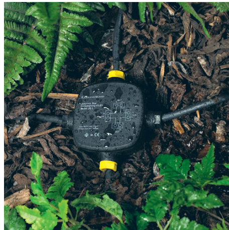
JB2 Junction box